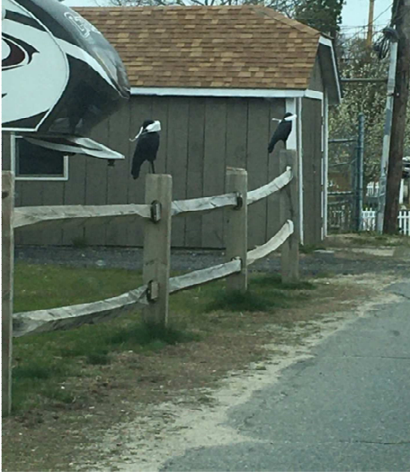
One picture to start! My neighbors plastic crows with masks and 6 feet apart.