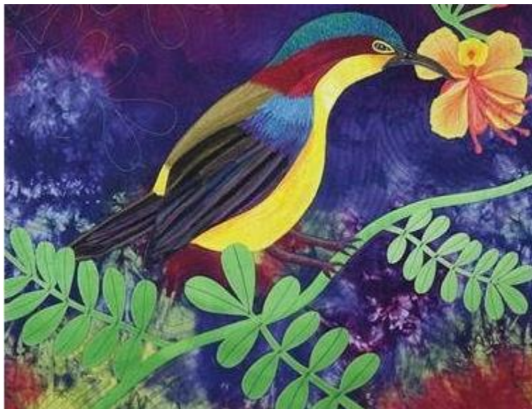
Elegant Sunbird