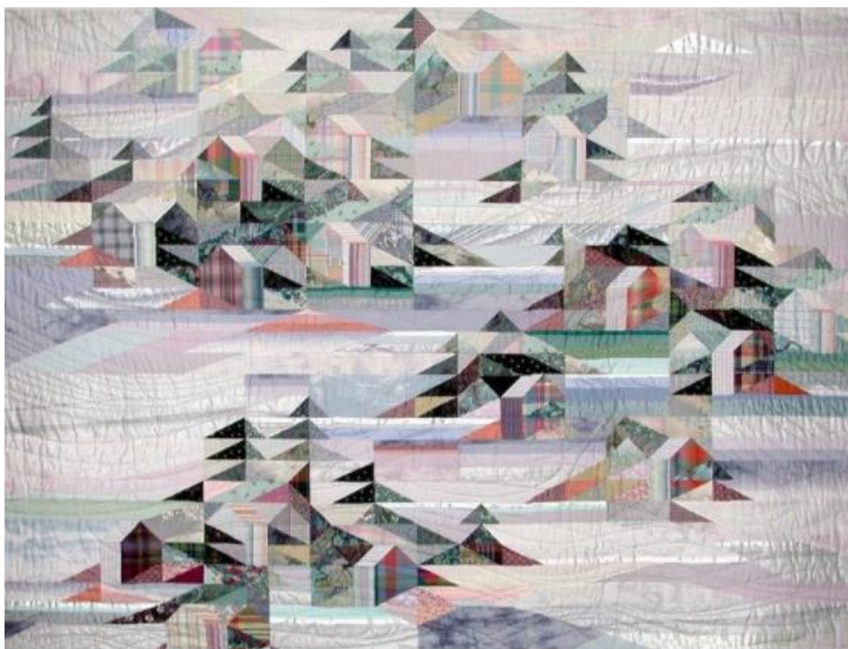
Detail) Archipelago, 1983 - Nancy Halpern - NEQM Collection, 1983.01

On View January 7 through March 27, 2021