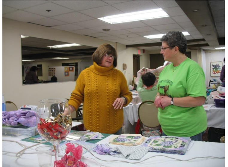
Always plenty of chocolate available!