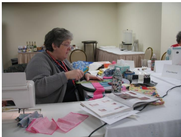
Our gadget queen.