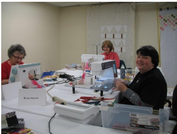
Doing what they love best!