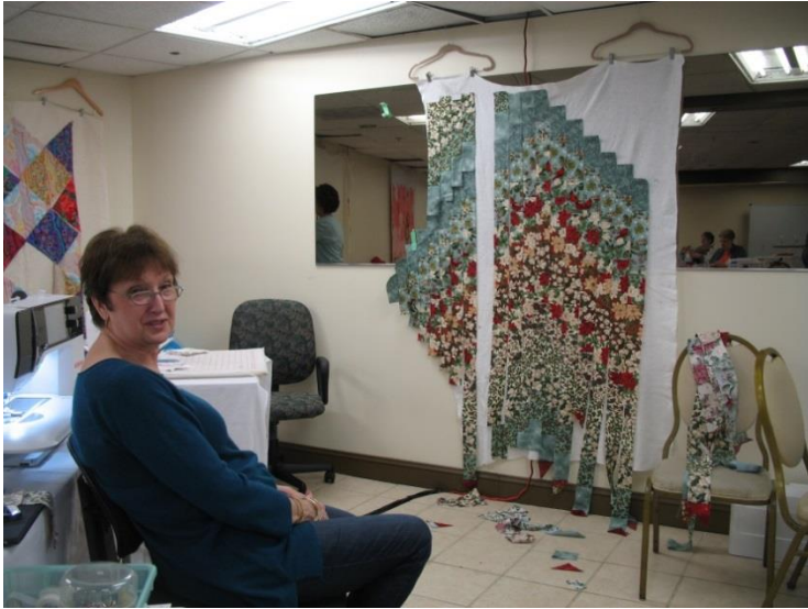
Planning it all out takes time and concentration.