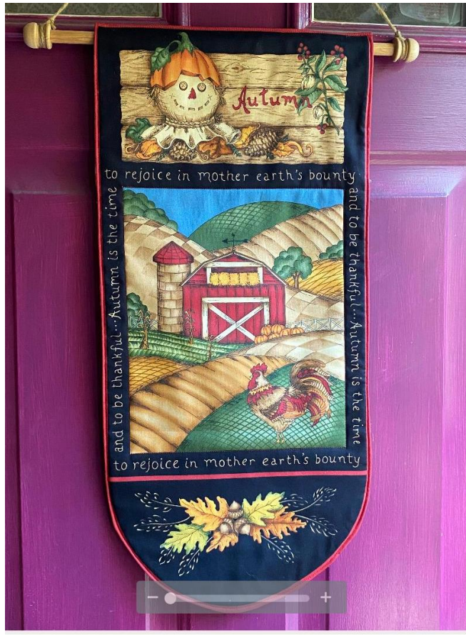
One of the panels from Upstairs Quilt Shop.