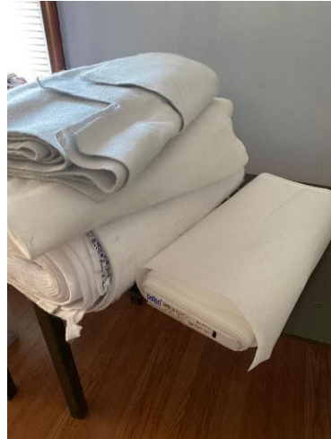
The "shop" is located at 54 Flagg St., Bridgewater