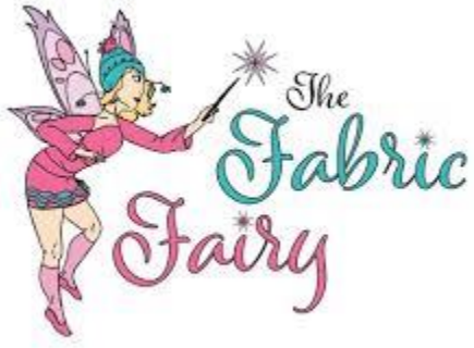
Upstairs Quilt Shop